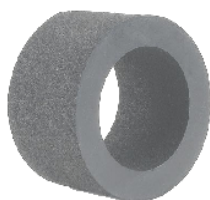
1/12th Gecko Foam rubber donut...

Having already had top drivers testing Gecko rubber on standard 1/12th wheels with outstanding results, Adams Racing are now planning to introduce a new range of 1/12th glued and trued foam rubber tyres (using our own new best design Gecko wheel) later in 2009.