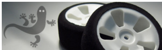
A free set of Gecko tyres to win.

If you have some friends who might be interested in winning their first set of Gecko tyres why not suggest they log onto our web site and register for the 'Gecko Tyres Newsletter' which will then make them eligible to win a set of Gecko tyres every month. please ask them to go to link and complete the registration form which is the 'contact' page on the web site.