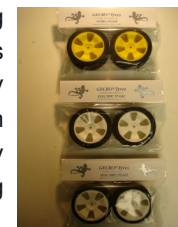
Gecko tyres at better prices.

Please see the Microtech Racing Gecko Tyres page for an example of UK Gecko tyre pricing. Microtech are our exclusive UK retailer.